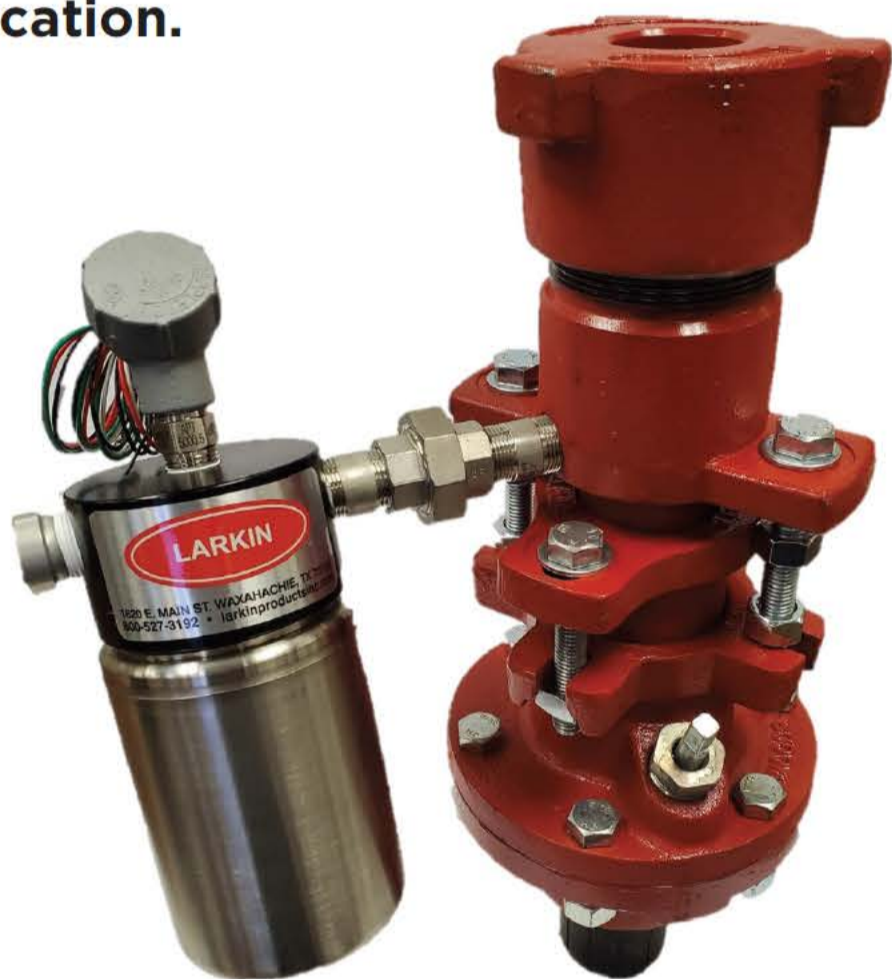
- Double Pack Stuffing box with LE-LUG & Larkin Environmental Leak Detector